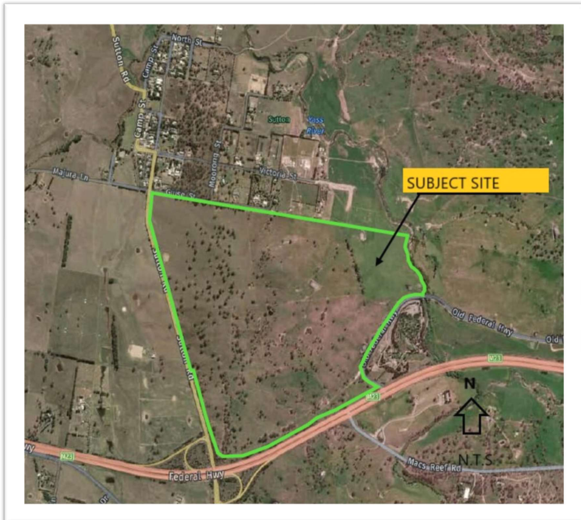
Figure 1 – Site

The property is used for cattle grazing on gently undulating topography (Figure 1). Vegetation on the site comprises pasture and areas of significant native vegetation and wildlife. For example, the site includes Box Gum Woodland, an endangered ecological community listed under the NSW Biodiversity Conservation Act 2016 and Commonwealth Environment Protection and Biodiversity Conservation Act 1999 .